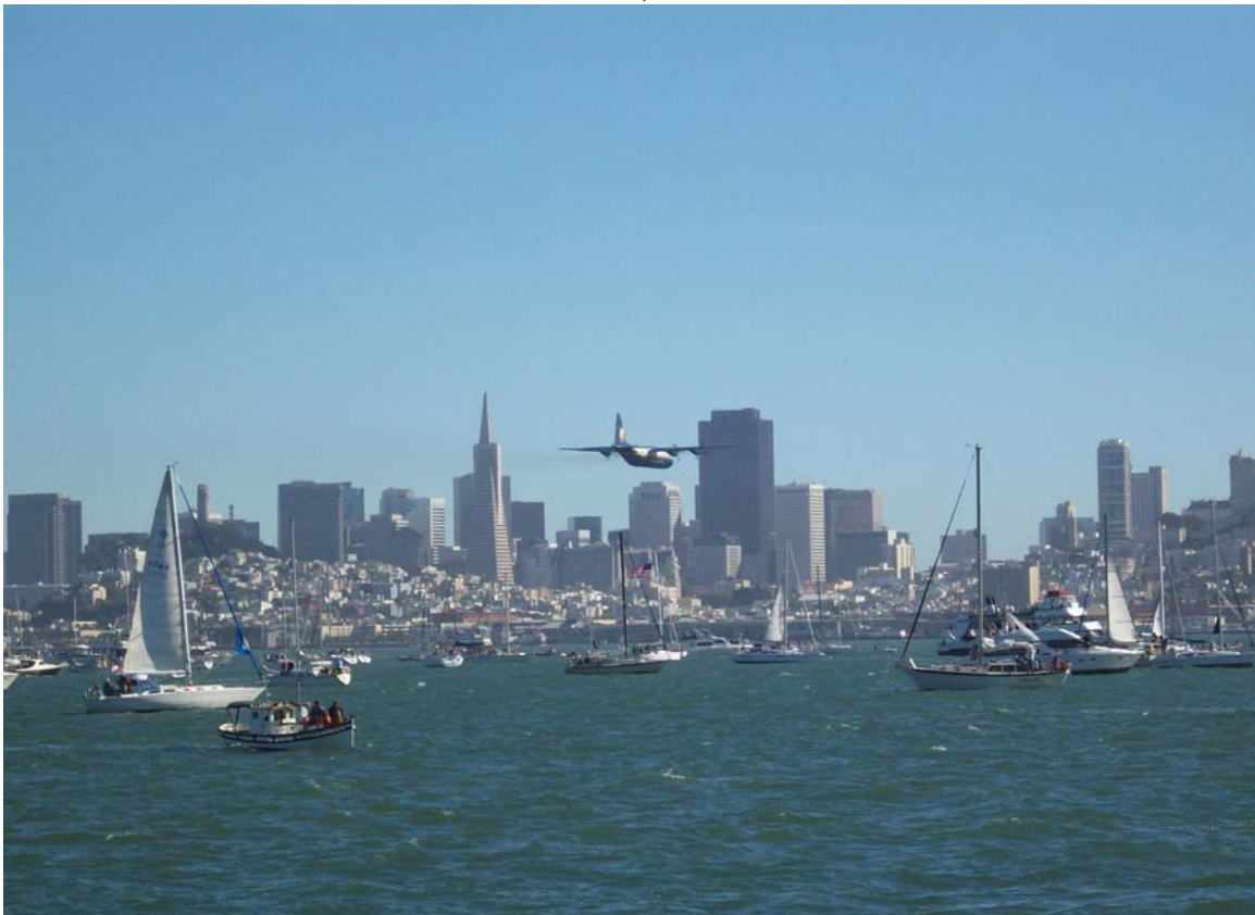
FLEET WEEK, SF SKYLINE AND "FAT ALBERT"