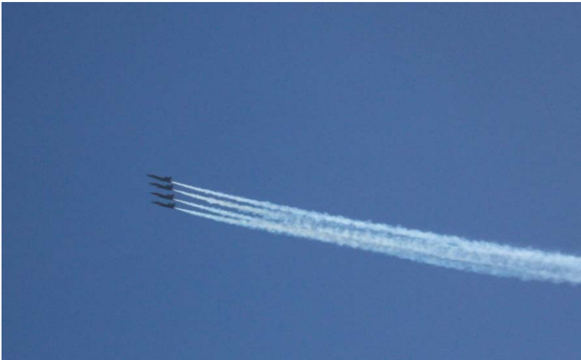
FLEET WEEK - BLUE ANGELS

Please call Tim the Admin at 408-391-2430 to make your Holiday Banquet Reservation or, by email, at t.ellenberger@sbcglobal.net